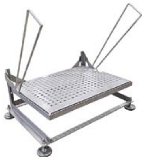
Adjustable stand, raised