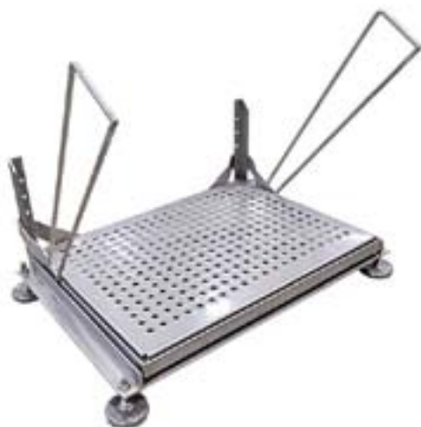
Adjustable stand, lowered